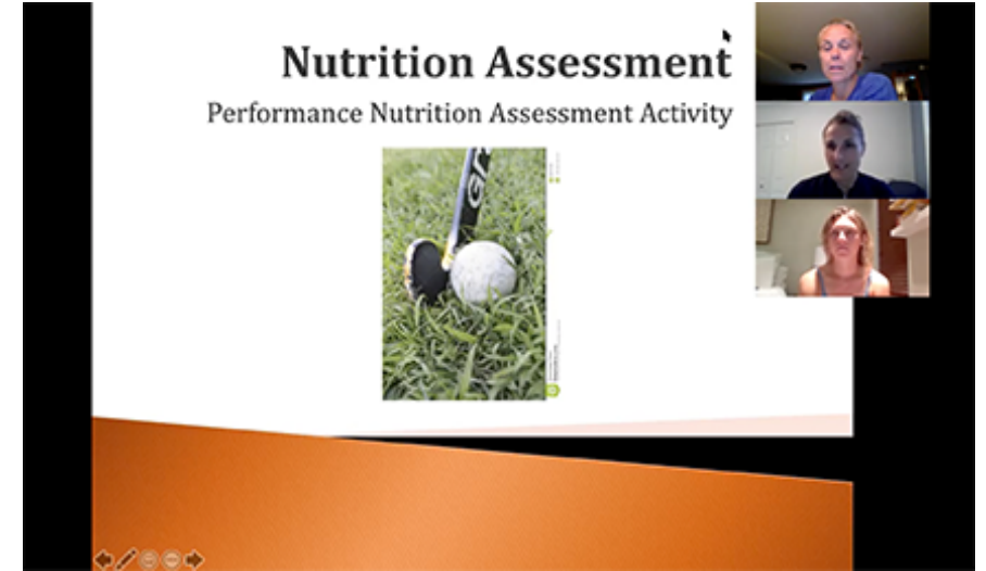
Christine Turpin Nutrition: Fueling to Perform